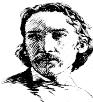
Robert Louis Stevenson

Robert Louis Stevenson wrote "There is no duty we so much underrate as the duty of being happy. By being happy we sow anonymous benefits upon the world." But some will say, "I can not be happy all the time." That is true, but we affect