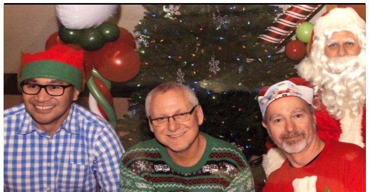
Santa with three naughty or nice children