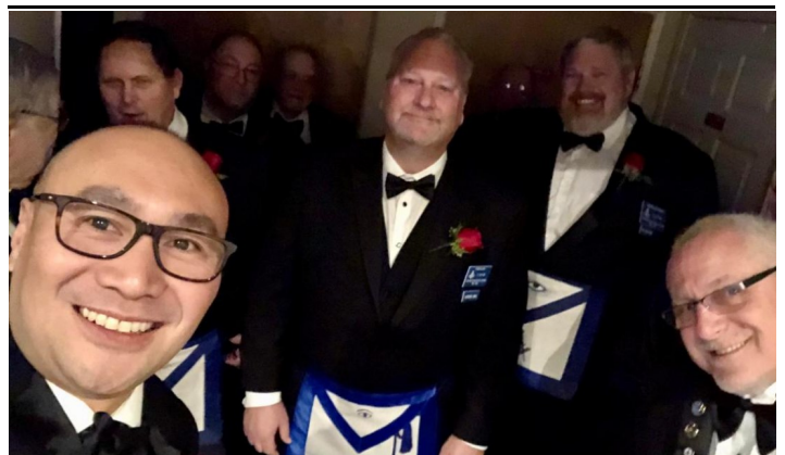
Officers waiting to be Installed