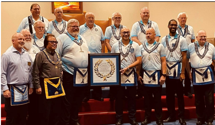
Officers, Inspector and Grand Lodge Representative at 100 Yr.