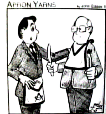
Don't get me wrong, Brother, I AM GLAD that you are here. Just try not to be so obvious as to WHY you are here.