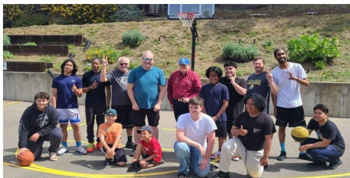
1st Annual DeMolay vs Freemasons Basketball Game