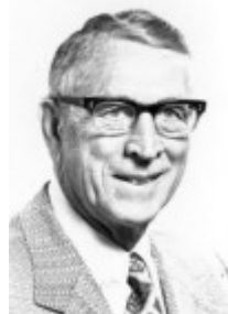
Coach John Wooden

Coach Wooden is quoted to have said that “success is peace of mind which is a direct result of self-satisfaction in knowing you did your best to become the best you are capable of becoming.” None of us are perfect. But, as the old adage shares, “If at first you don’t succeed, try, try again.”